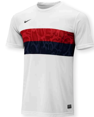
728944 / SS DIGITAL GAME JERSEY 16 / $50 728971 / YOUTH SS DIGITAL GAME JERSEY 16 / $45

Designed for the elite level athlete, fully sublimated short-sleeve game jersey delivers the ultimate in soccer uniforms. Dri-FIT flat back mesh provided for a high performance jersey. Fully customized with the ability for a unique team name or logo placed at the upper left front or center front, depending on the design chosen. Numbering variations also available. Back name placement options are also available. Body width: 22", body length: 30.25" (size large). Youth body width: 16.75", youth body length: 22.75" (size medium).