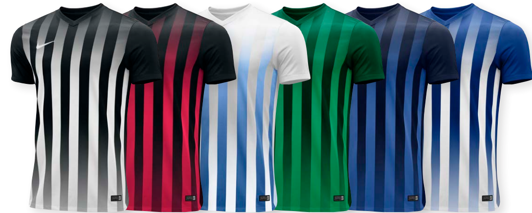
010 blk/wht/(wht) 011 blk/unv red/(wht) 104 wht/unv blu/(blk) 303 pn grn/gym grn/(wht) 419 cilg nvy/gm ryl/(wht) 480 gm ryl/wht/(wht)

820700 / SS STRIPED DIVISION II / $40 820701 / YOUTH SS STRIPED DIVISION II / $35