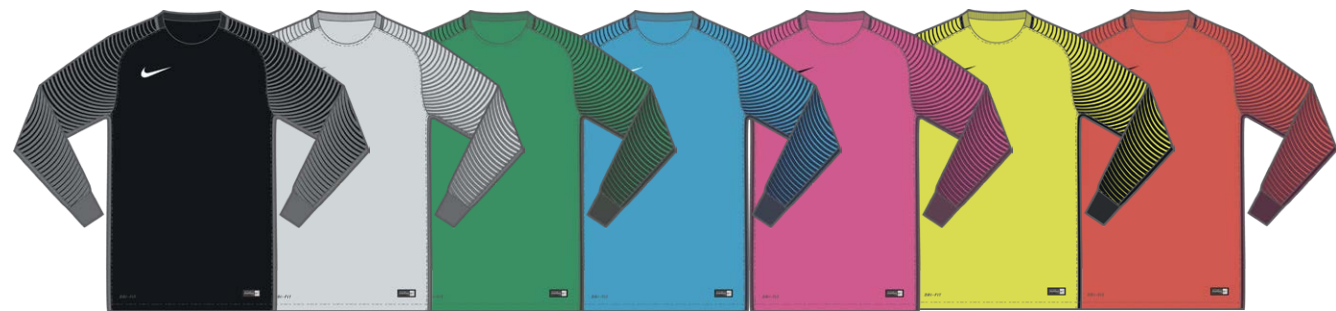
011 blk/cl gry/(wht) 043 pur pltnm/cl gry/(blk) 319 lcd grn/grv grn/(wht) 430 crmt blu/md nvy/(wht) 639 hypr pnk/vln red/(wht) 702 vlt/blk/(wht) 671 brt crmsn/dp grmt/(wht)