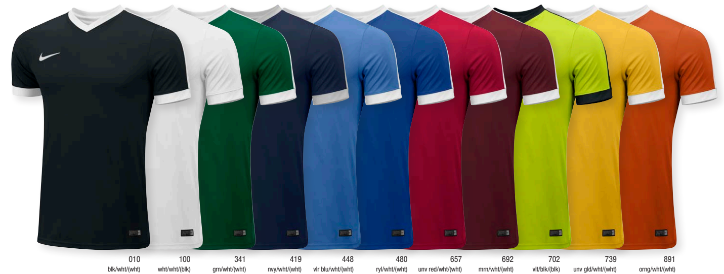
725898 / SS STRIKER IV JERSEY / $30 725981 / YOUTH SS STRIKER IV JERSEY / $25

FIRST OFFER DATE: 1-1-2015 ADULT SIZES: S, M, L, XL, 2XL END DATE: 12-31-2019 YOUTH SIZES: XS, S, M, L, XL FABRIC: 100% POLYESTER