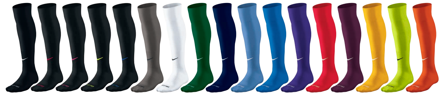
010 blk/(wht) 012 blk/(unv red) 013 blk/(vvd pnk) 014 blk/(vlt) 015 blk/(ryl) 057 gry/(blk) 100 wht/(blk) 323 grg grn/(wht) 410 clg nvy/(wht) 448 vlr blu/(wht) 460 gm ryl/(wht) 545 crt prpl/(wht) 648 unv red/(wht) 677 tm mrm/(wht) 750 unv gld/(wht) 715 vlt/(blk) 888 unv orng/(wht)

FIRST OFFER DATE: 1-1-2016 END DATE: 12-31-2019 ADULT SIZES: XS, S, M, L, XL FABRIC: 88% NYLON/9% POLYESTER/3% SPANDEX.