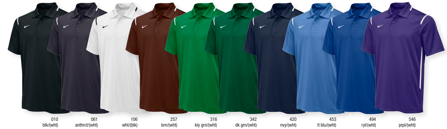
010 blk/(wht) 061 anthrct/(wht) 106 wht/(blk) 257 brn/(wht) 316 kly grn/(wht) 342 dk grn/(wht) 420 nvy/(wht) 453 lt blu/(wht) 494 ryl/(wht) 546 prpl/(wht)

FIRST OFFER DATE: 10-1-2015 ADULT SIZES: XS, S, M, L, XL, 2XL, 3XL END DATE: 10-1-2018 FABRIC: 100% POLYESTER