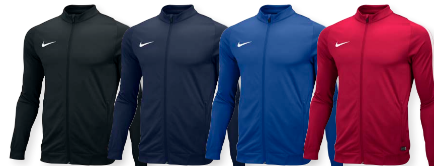
010 blk/wht/(wht) 419 clg nvy/wht/(wht) 480 gm ryl/wht/(wht) 657 unv red/wht/(wht)

725941 / SQUAD16 KNIT TRACK JACKET / $75 726001 / YOUTH SQUAD16 KNIT TRACK JACKET / $70