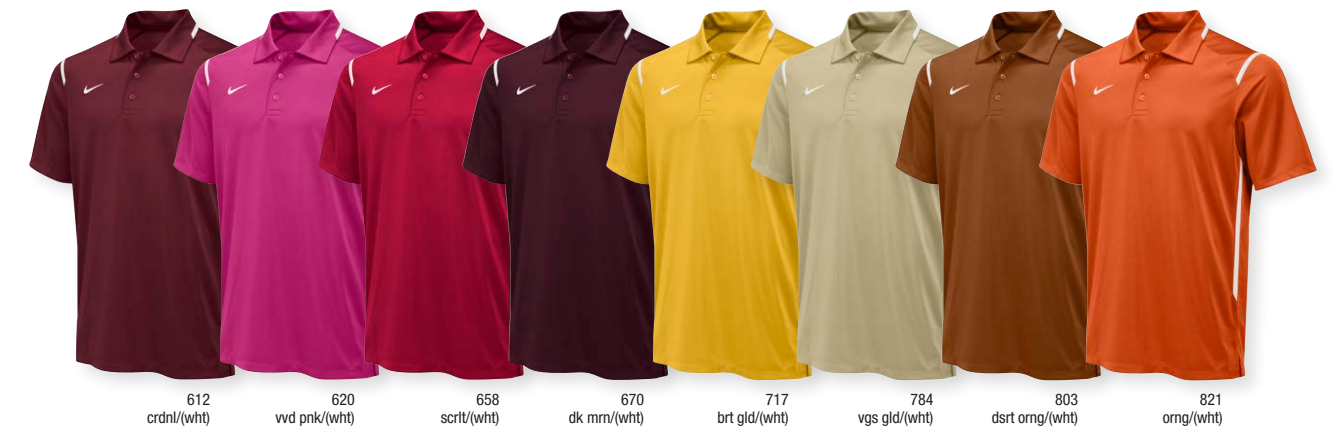
612 crdnl/(wht) 620 vvd pnk/(wht) 658 scrll/(wht) 670 dk mrm/(wht) 717 brt gld/(wht) 784 vgs gld/(wht) 803 dsrt org/(wht) 821 org/(wht)