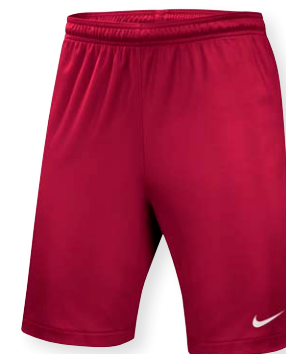
728946 / DIGITAL EQUALISER SHORT / $45 728979 / YOUTH DIGITAL EQUALISER SHORT / $40

FIRST OFFER DATE: 1-1-2016 END DATE: 12-31-2018 FABRIC: 100% POLYESTER ADULT SIZES: S, M, L, XL, 2XL YOUTH SIZES: S, M, L, XL