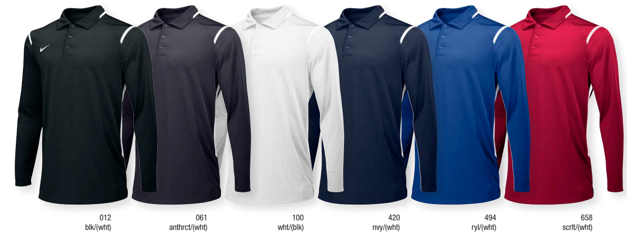
012 blk/(wht) 061 anthrct/(wht) 100 wht/(blk) 420 nvy/(wht) 494 ryl/(wht) 658 scrll/(wht)

FIRST OFFER DATE: 1-1-2015 ADULT SIZES: S, M, L, XL, 2XL, 3XL, 4XL END DATE: 4-1-2018 FABRIC: 100% POLYESTER