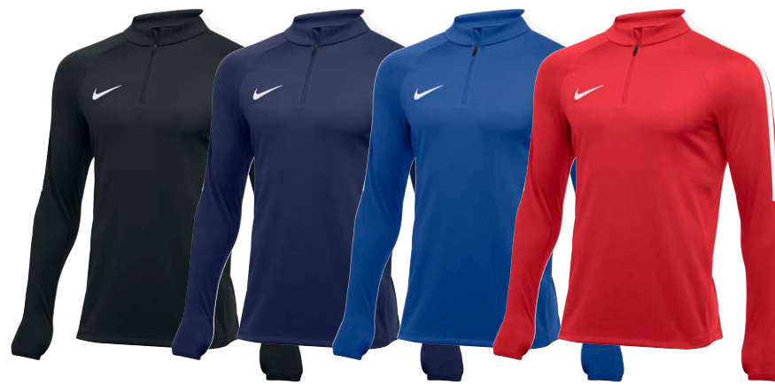
010 blk/wht/(wht) 452 obsdn/wht/(wht) 463 ryl blw/wht/(wht) 657 unv red/wht/(wht)

831569 / SQUAD17 DRILL TOP 2 / $70 831582 / YOUTH SQUAD17 DRILL TOP 2 / $65