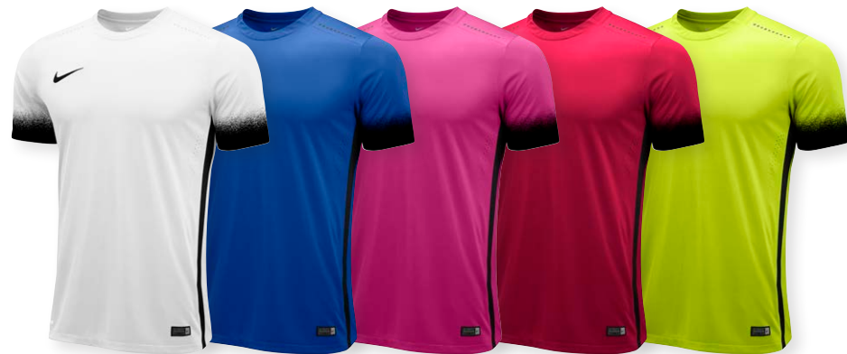
100 wht/blk/(blk) 480 gm ryl/blk/(blk) 616 vvd pnk/blk/(blk) 657 unv red/blk/(blk) 702 vlt/blk/(blk)

NEW FIRST OFFER DATE: 1-1-2017 ADULT SIZES: S, M, L, XL, 2XL END DATE: 12-31-2018 YOUTH SIZES: XS, S, M, L, XL FABRIC: 100% POLYESTER