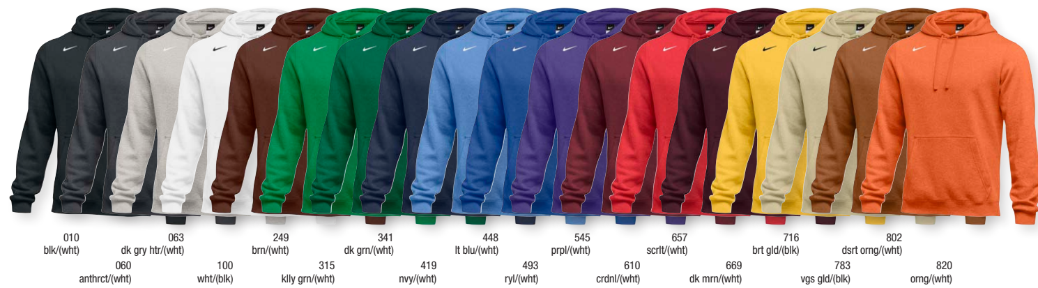
010 blk/(wht) 063 dk gry htr/(wht) 249 brn/(wht) 341 dk grn/(wht) 448 lt blu/(wht) 545 prpl/(wht) 657 scrtr/(wht) 716 brt gld/(blk) 802 dsrt orng/(wht) 060 anthrct/(wht) 100 wht/(blk) 315 kily grn/(wht) 419 nvy/(wht) 493 ryl/(wht) 610 crdnl/(wht) 669 dk mrn/(wht) 783 vgs gld/(blk) 820 orng/(wht)

835585 / NIKE TEAM CLUB FLEECE HOODY / $45 836308 / YOUTH NIKE TEAM CLUB FLEECE HOODY / $40