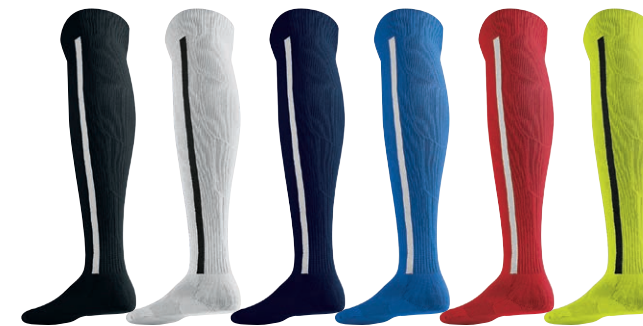
010 blk/(wht) 156 wht/(blk) 419 clg nvy/(wht) 493 gm ryl/(wht) 658 unv red/(wht) 715 vlt/(blk)

FIRST OFFER DATE: 1-1-2016 END DATE: 12-31-2019 ADULT SIZES: S, M, L, XL FABRIC: 100% POLYESTER