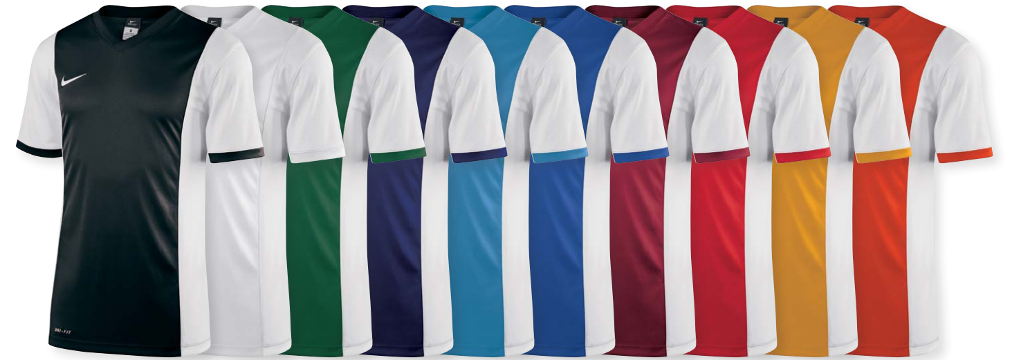
010 blk/wht/(wht) 101 wht/wht/(blk) 341 grg grn/wht/(wht) 419 clg nvy/wht/(wht) 448 vlr blu/wht/(wht) 493 gm ryl/wht/(wht) 610 tm mrr/wht/(wht) 657 unv red/wht/(wht) 739 unv gld/wht/(wht) 820 tm orng/wht/(wht)

ADULT SIZES: S, M, L, XL, 2XL YOUTH SIZES: XS, S, M, L, XL