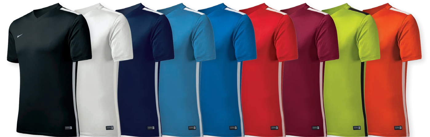
010 blk/wht/(wht) 156 wht/wht/(blk) 419 cilg nvy/wht/(wht) 448 vlr blu/wht/(wht) 493 gm ryl/wht/(wht) 657 unv red/wht/(wht) 692 tm mrr/wht/(wht) 715 vlt/blk/(blk) 891 tm orng/wht/(wht)

FIRST OFFER DATE: 1-1-2016 ADULT SIZES: S, M, L, XL END DATE: 12-31-2018 YOUTH SIZES: XS, S, M, L, XL FABRIC: 100% POLYESTER