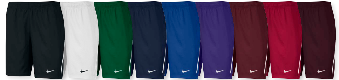
010 blk/(wht) 100 wht/(blk) 342 dk grn/(wht) 420 nvy/(wht) 494 ryl/(wht) 546 prpl/(wht) 612 crdnl/(wht) 658 scrll/(wht) 670 dk mnn/(wht)