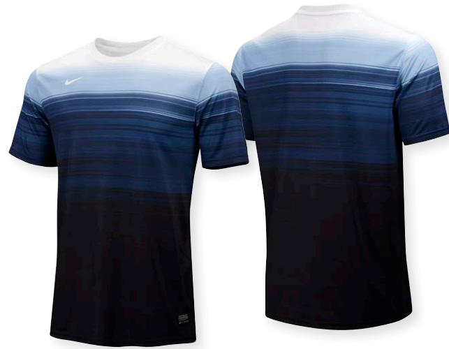
728945 / SS DQT GAME JERSEY 16 / $80 728960 / YOUTH SS DQT GAME JERSEY 16 / $75

Designed for the elite level athlete, fully sublimated short-sleeve game jersey delivers the ultimate in soccer uniforms. Dri-FIT flat back mesh provided for a high performance jersey. Fully customized with the ability for a unique team name or logo placed at the upper left front or center front, depending on the design chosen. Numbering variations also available. Back name placement options are also available. Body width: 22", body length: 30.25" (size large). Youth body width: 16.75", youth body length: 22.75" (size medium).