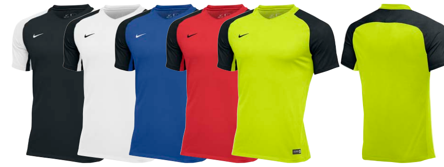
011 blk/wht(wht) 100 wht/blk(blk) 455 ryl blu/blk(wht) 657 unv red/blk(blk) 702 volt/blk(blk)

876974 / US SS REVOLUTION JERSEY / $55 876975 / YOUTH US SS REVOLUTION JERSEY / $50