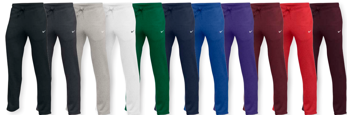
010 blk/(wht) 060 anthrct/(wht) 063 dk gry hthr/(wht) 100 wht/(blk) 341 dk grn/(wht) 419 nvy/(wht) 493 ryl/(wht) 545 prpl/(wht) 610 crdnl/(wht) 657 scrtr/(wht) 669 dk mrn/(wht)

FIRST OFFER DATE: 1-1-2015 ADULT SIZES: XS, S, M, L, XL, 2XL, 3XL END DATE: 4-1-2018 FABRIC: 100% POLYESTER