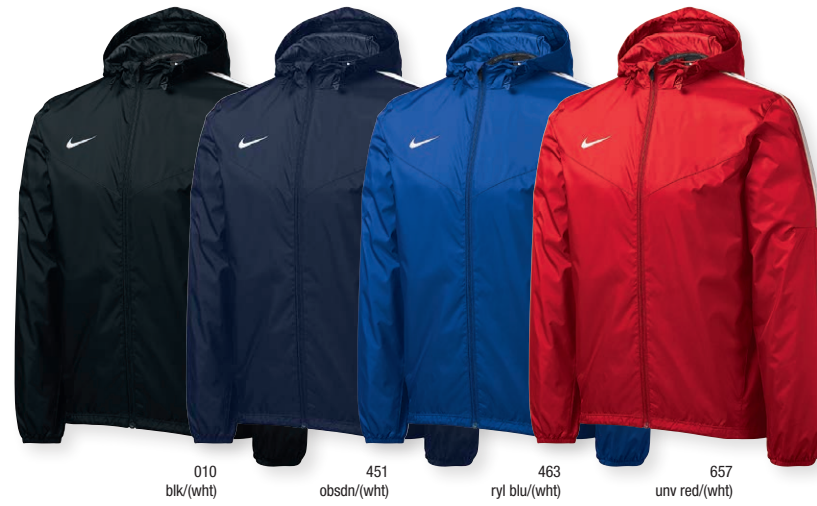
010 blk/(wht) 451 obsdn/(wht) 463 ryl blu/(wht) 657 unv red/(wht)