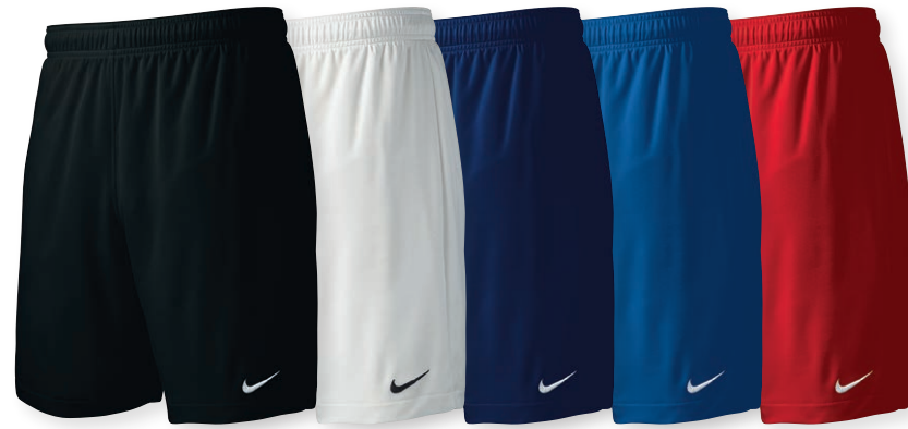
010 blk/(wht) 156 wht/(blk) 419 nvy/(wht) 493 ryl/(wht) 657 scrt/(wht)