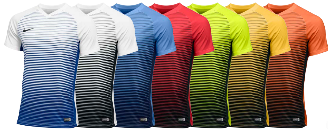
100 wht/gm ryl/(blk) 101 wht/blk/(blk) 412 unv blu/cilg nvy/(wht) 657 unv red/blk/(wht) 702 volt/blk/(blk) 739 unv gld/blk/(wht) 891 tm orng/blk/(wht)

886828 / US SS PRECISION IV JERSEY / $50 886830 / YOUTH US SS PRECISION IV JERSEY / $45