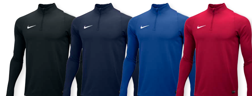
010 blk/wht/(wht) 419 clg nvy/wht/(wht) 480 gm ryl/wht/(wht) 657 unv red/wht/(wht)

725942 / SQUAD16 DRILL TOP / $70 725996 / YOUTH SQUAD16 DRILL TOP / $65