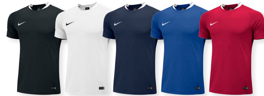
010 blk/wht/(wht) 100 wht/wht/(blk) 419 clg nvy/wht/(wht) 480 gm ryl/wht/(wht) 657 unv red/wht/(wht)

725945 / SQUAD16 FLASH SS TOP / $45 725994 / YOUTH SQUAD16 FLASH SS TOP / $40