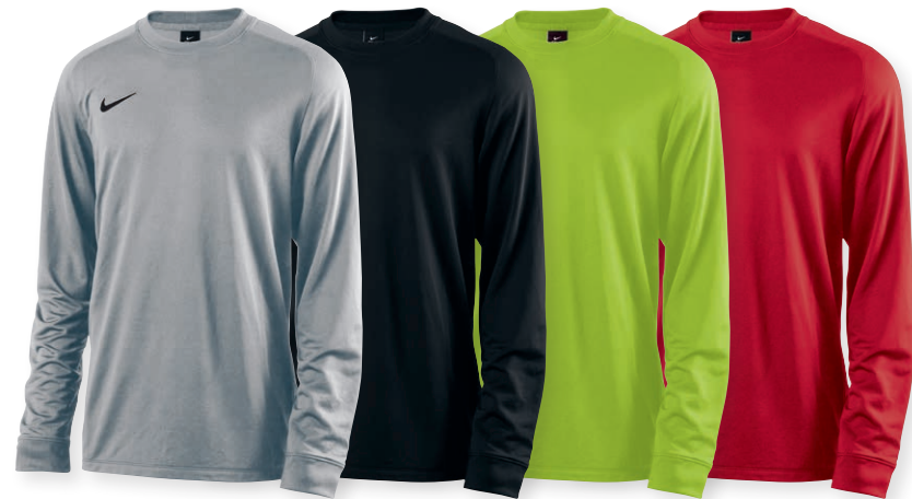
001 mtt slvr/(blk) 010 blk/(wht) 303 elctr grn/(blk) 657 unv red/(wht)

FIRST OFFER DATE: 1-1-2016 END DATE: 12-31-2019 FABRIC: 100% POLYESTER ADULT SIZES: S, M, L, XL, 2XL