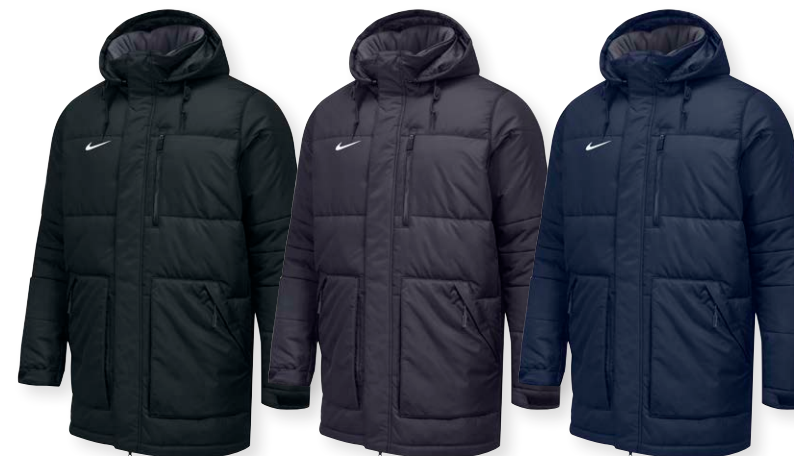
020 blk/anthrct/(wht) 060 anthrct/anthrct/(wht) 418 nvy/anthrct/(wht)

FIRST OFFER DATE: 4-1-2017 ADULT SIZES: S, M, L, XL, 2XL, 3XL, 4XL, *LT, XLT, 2XLT, 3XLT, 4XLT YOUTH SIZES: S, M, L, XL END DATE: 4-1-2020 FABRIC: SOLID: 80% COTTON/20% POLYESTER. HEATHER: 70% COTTON/30% POLYESTER.