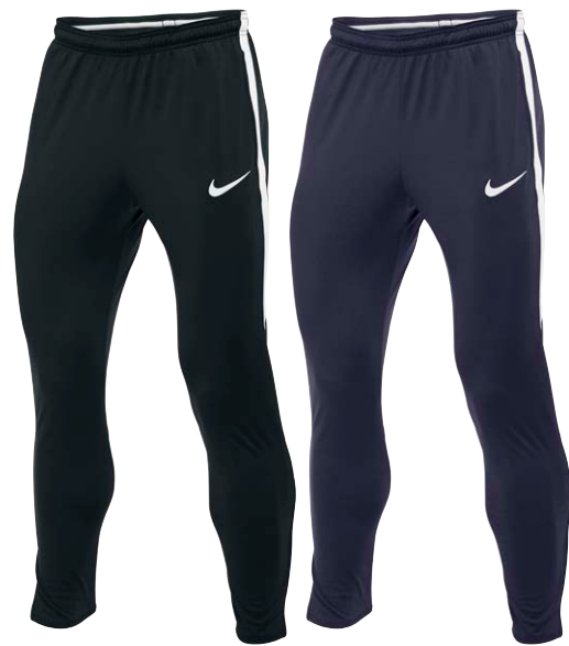
010 blk/wht/(wht) 452 obsdn/wht/(wht)

NEW FIRST OFFER DATE: 1-1-2017 END DATE: 12-31-2019 ADULT SIZES: S, M, L, XL, 2XL YOUTH SIZES: XS, S, M, L, XL FABRIC: 100% POLYESTER