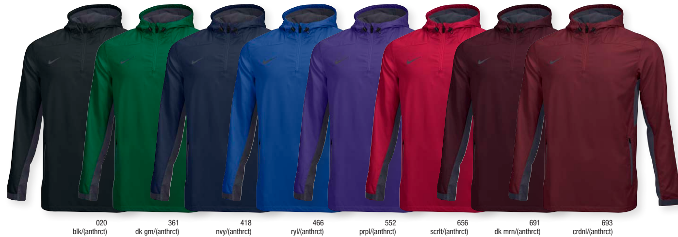
020 blk/(anthrct) 361 dk grn/(anthrct) 418 nvy/(anthrct) 466 ryl/(anthrct) 552 prpl/(anthrct) 656 scrll/(anthrct) 691 dk mrm/(anthrct) 693 crdnl/(anthrct)

FIRST OFFER DATE: 1-1-2016 ADULT SIZES: S, M, L, XL END DATE: 12-31-2018 YOUTH SIZES: XS, S, M, L, XL FABRIC: 100% POLYESTER