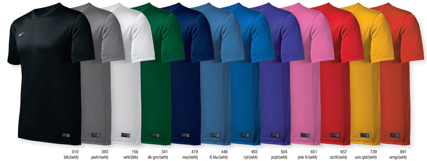
645504 / SS TIEMPO II JERSEY / $20 646399 / YOUTH SS TIEMPO II JERSEY / $19

FIRST OFFER DATE: 1-1-2015 ADULT SIZES: S, M, L, XL END DATE: 12-31-2017 YOUTH SIZES: XS, S, M, L, XL FABRIC: 100% POLYESTER