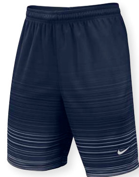
728955 / DQT EQUALISER SHORT / $60 728985 / YOUTH DQT EQUALISER SHORT / $55

FIRST OFFER DATE: 1-1-2016 END DATE: 12-31-2018 FABRIC: 100% POLYESTER ADULT SIZES: S, M, L, XL, 2XL YOUTH SIZES: S, M, L, XL