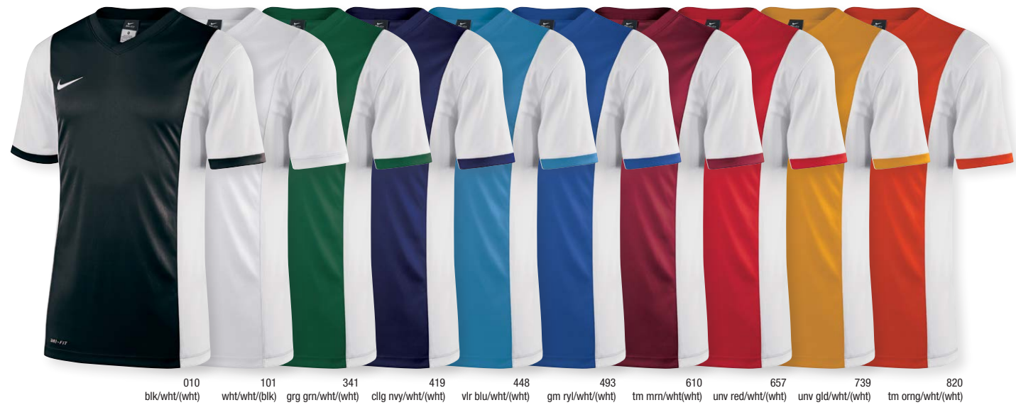
620879 / PARK DERBY JERSEY / $30 620877 / YOUTH PARK DERBY JERSEY / $25

Short-sleeve jersey with rib v-neck with cross over at center front. Cut and sew front and back panel. Set in sleeves. Elasticated back neck tape. Embroidered Swoosh design trademark on right chest. Woven label on lower left hem. Dri-FIT logo on lower right hem. Body width: 22", body length: 29.75" (size large). Youth body width: 16.75", youth body length: 22.75" (size medium).