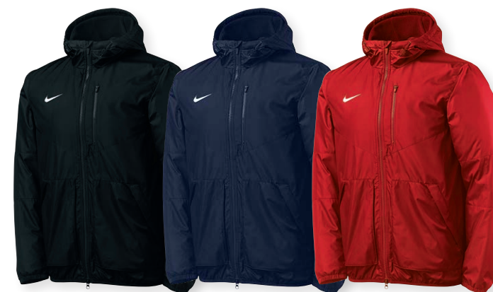
010 blk/anthrct/(wht) 451 obsdn/dk obsdn/(wht) 657 unv red/unv red/(wht)

FIRST OFFER DATE: 4-1-2017 ADULT SIZES: S, M, L, XL, 2XL, 3XL, 4XL, *LT, XLT, 2XLT, 3XLT, 4XLT YOUTH SIZES: S, M, L, XL END DATE: 4-1-2020 FABRIC: SOLID: 80% COTTON/20% POLYESTER. HEATHER: 70% COTTON/30% POLYESTER.