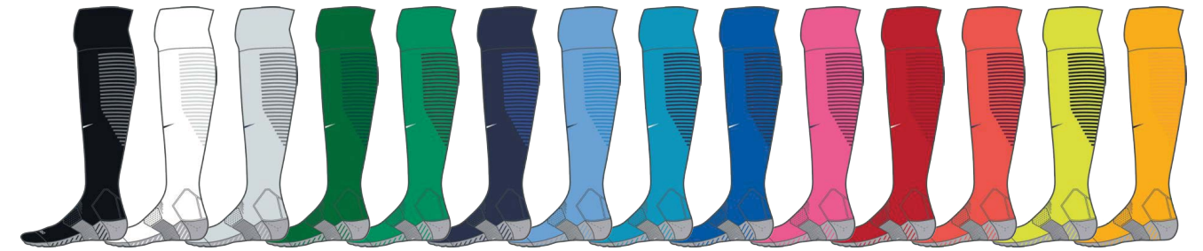
011 blk/(wht) 100 wht/(blk) 043 pltnm/(blk) 302 pn grn/(wht) 319 lcd grn/(wht) 410 nvy/(wht) 412 unv blu/(blk) 430 crmt blu/(wht) 463 ryl blu/(wht) 639 hypr pnk/(blk) 657 unv rd/(wht) 671 brt crm/(blk) 702 vlt/(blk) 739 unv gld/(blk)

FIRST OFFER DATE: 1-1-2014 END DATE: 12-31-2018 FABRIC: 100% POLYESTER ADULT SIZES: S, M, L, XL YOUTH SIZES: XS, S, M, L, XL